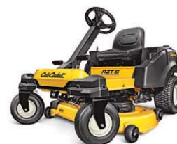
RZT S SERIES FOUR-WHEEL STEER ZERO-TURN RIDERS