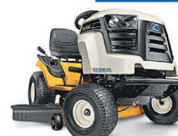
SERIES 1000 LTX KW LAWN TRACTORS