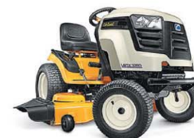
SERIES 1000 WITH ELECTRIC POWER STEERING LGTX LAWN AND GARDEN TRACTORS