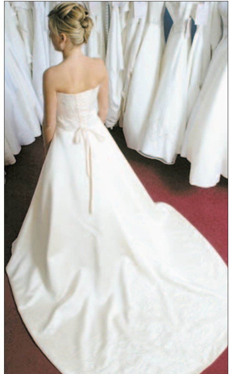
Above: a champagne-hued gown, from Formal Affair, with silver embroidery and a corset back, shown at left.