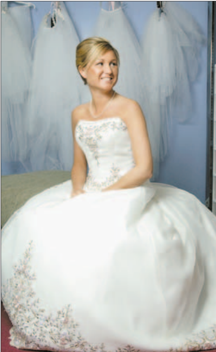
Above: An ivory gown, from Formal Affair, featuring multi-color embroidery. Above right: Diamond drop earrings and a dangling necklace, from CC Fine Jewelry.