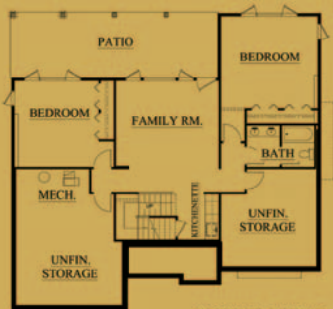
LOWER LEVEL PLAN 1046 SQ. FT. (Finished)