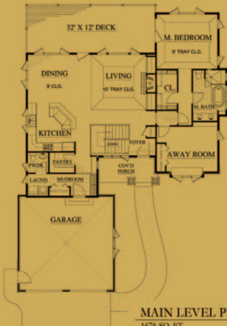
MAIN LEVEL PLAN 1676 SQ. FT.