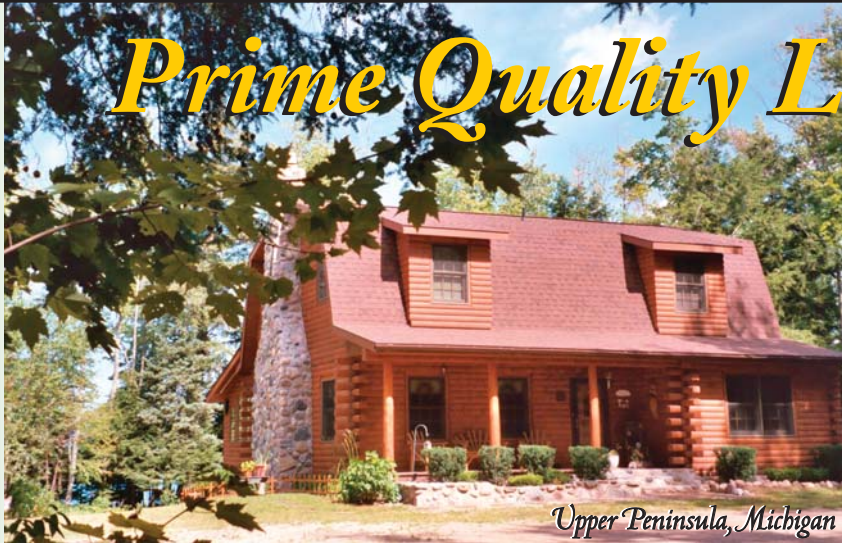
Upper Peninsula, Michigan

IF ROLLS ROYCE BUILT HOMES...they simply could not surpass this elegant, custom log home on ten acres of land with 173' of Lake Superior sand beach frontage located 30 miles East of Marquette. Four bedrooms, 2 full baths, two 2 car garages with an apartment for guests located above one of the garages. 2,668 square feet of living space includes a "curly maple" staircase leading to the Master Suite. Frank Lloyd Wright style Hickory cabinets in the modern kitchen give a functional balance of beauty, comfort and convenience. A library, a family room and a hot tub room with skylights are a few of the additional amenities in this Fine Home. $595,000. 172½' of additional frontage available.