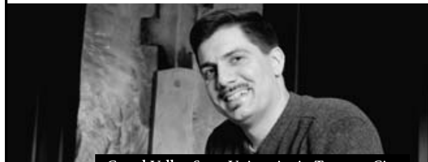
Grand Valley State University in Traverse City