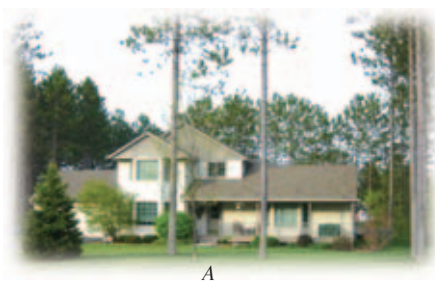
wonderful family home! Entertaining will be a pleasure in this fabulous four bedroom, three and a half bath home which includes two master suites, vaulted ceilings, hardwood & ceramic floors, a "cook's" kitchen, sound system and an in-ground swimming pool surrounded by a beautifully landscaped yard. $289,900.