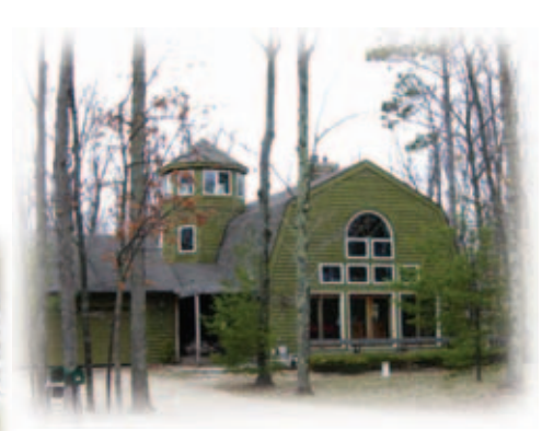
Duck Lake views and access will be enjoyed year round in this lovely home. Included is a unique third story observation tower, 2-story Great Room with floor to ceiling split stone fireplace, four bedrooms, two baths, hardwood floors, skylights, bay windows and gourmet kitchen. $259,900.