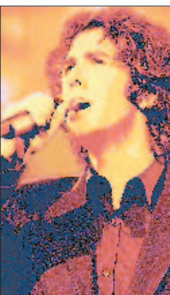
Josh Groban will perform on July 20 at Interlochen.

The Interlochen Arts Festival is one of the busiest venues, with 30 guest artist performances. They start on June 16 and run until Aug. 23.