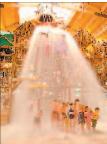
Great Wolf Lodge

Fort MacKenzie at Great Wolf Lodge in Traverse City.