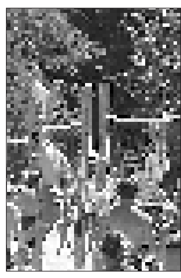
Two-person and four-person vollevball tournaments will be held during the festival.