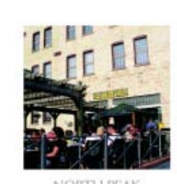
BREWING CO TRAVERSE CITY