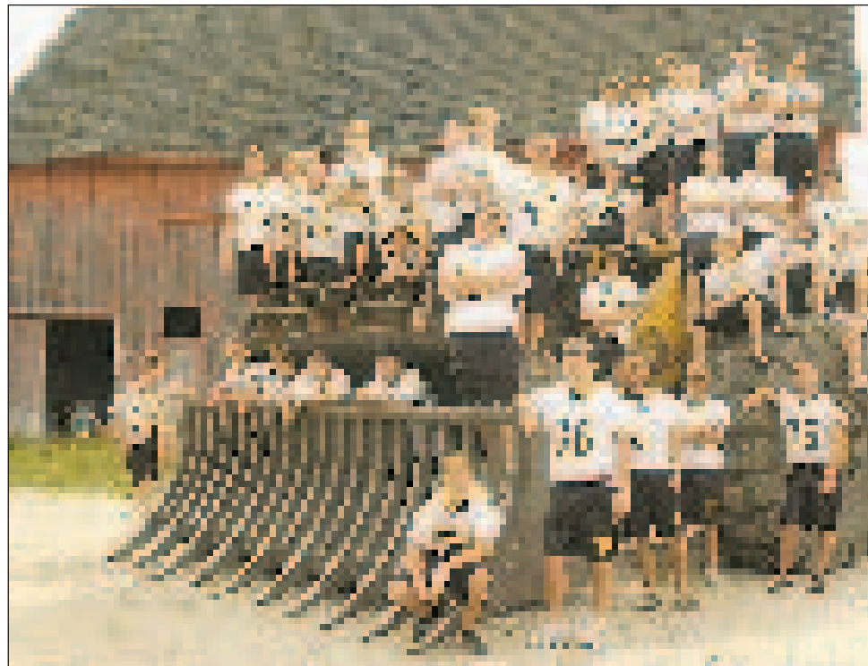
Coming off its first playoff appearance since the two Traverse City schools split, TC Central is loading up for the 2004 season.