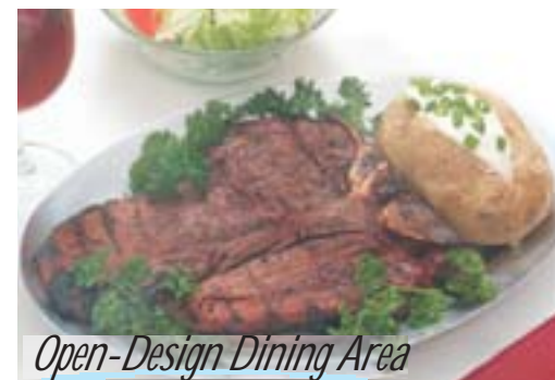
Open-Design Dining Area

Relax in soft seating and enjoy a glass of Michigan wine paired with New England Crab Cakes or any of our exceptional specialty appetizers.