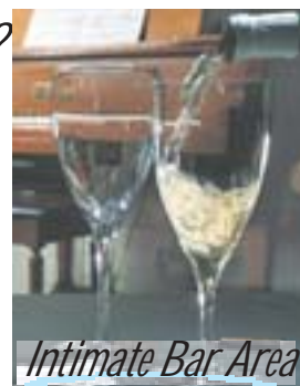
Intimate Bar Area

From a light snack to comfortable conversation over a glass of wine to fine dining, the all-new Blue Water Bistro at Holiday West Bay offers three distinctly different dining opportunities: