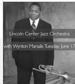
Lincoln Center Jazz Orchestra with Wynton Marsalis Tuesday, June 17