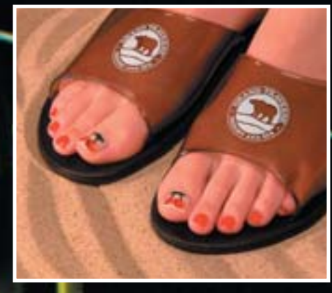
Include "Cherry Nail Art" with your pedicure or manicure for $15.

Subject to availability. Offer expires 7/31/03. For reservations call 231-938-5730.