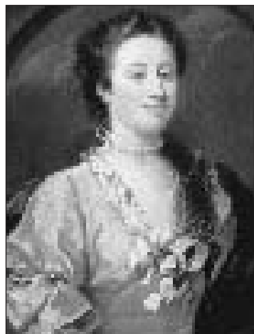
Portrait of a Lady, 1740 by William Hogarth.

"Pursuits and Pleasures: Baroque Paintings from the Detroit Institute of Arts" is on display June 28-Sept. 14 at the Dennos, on the Northwestern Michigan College campus. The collection of 35 works from the so-called "Golden Age" of European painting is the largest loan of European Old Master paintings to travel the