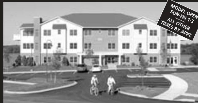
Lake Ridge Realty LLC

Located on the shores of picturesque Boardman Lake.