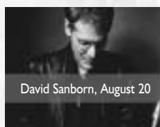
David Sanborn, August 20

A six-time Grammy Award winner with a career that spans two decades, Sanborn is one of contemporary music's premier instrumentalists who continues to thrill audiences with his visceral emotional style. Tickets $30, Corson