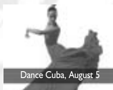
Dance Cuba, August 5

Composed exclusively of vibrant female dancers of the Flamenco form, Dance Cuba weaves a mixture of passions and emotions with Hispanic rhythms, Cuban music and an excellent ensemble of live musicians. Tickets $25.50, Kresge