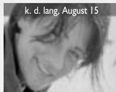
k. d. lang, August 15

A three-time Grammy Award winner, this charismatic entertainer has developed her own signature contemporary sound and redefined torch singing for a new generation. Tickets $27.50 - $34.50. $100 VIP, Kresge