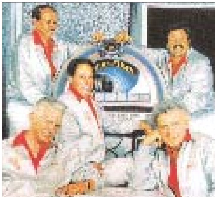
The Reflections appear at Shanty Creek July 26.