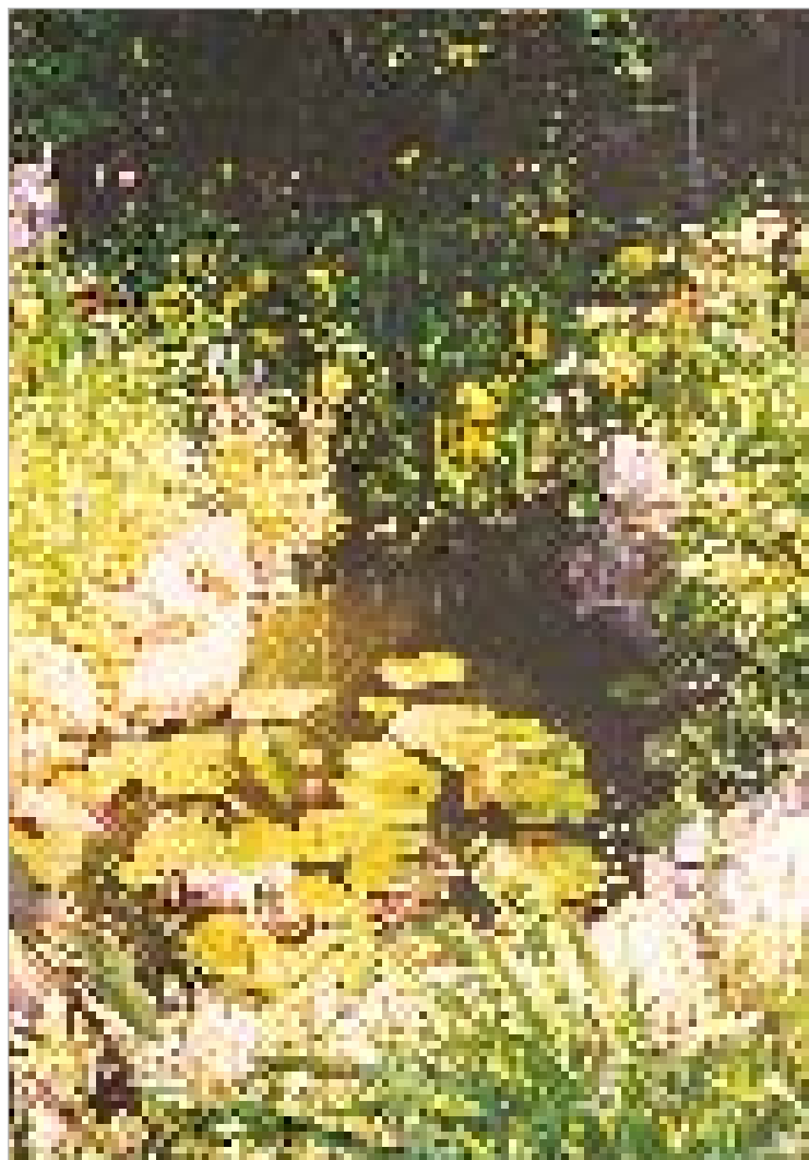
The above ponds can be seen at one of the homes on the Friendly Garden Club's annual walk on July 17. This year's theme is Gardening by the Lake, featuring gardens along south Lake Leelanauu.

■ The Friendly Garden Club of Traverse City celebrated their 80th anniversary in 2002. Their object is to stimulate the knowledge and love of gardening among all ages; to aid in the