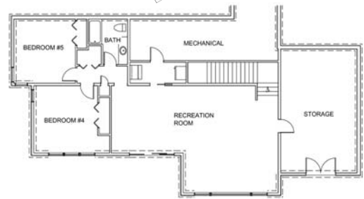
BASEMENT & FOUNDATION PLAN

Tompke Construction Steve Tompke 320 Thousand Oaks Drive Traverse City, MI 49686 231-946-4099