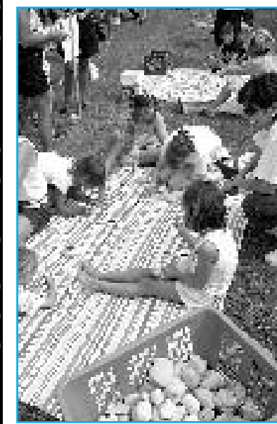
Record-Eagle file photo

For more information on Festival Community Works Programs visit our web site at www.cherryfestival.org or call 231-947-4230.