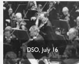
DSO, July 16

Ion Marin, conductor Marc-André Hamelin, piano Berlioz: Le corsaire Rachmaninoff: Piano Concerto No. 2 Berlioz: Symphonie fantastique Tickets $24.50 - $34.50, Kresge