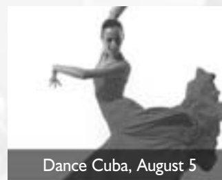
Dance Cuba, August 5

Composed exclusively of vibrant female dancers of the Flamenco form, Dance Cuba weaves a mixture of passions and emotions with Hispanic rhythms, Cuban music and an excellent ensemble of live musicians. Tickets $25.50, Kresge