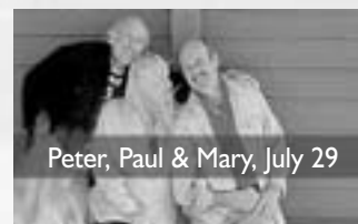
Peter, Paul & Mary, July 29

The most popular folk group of the '60s returns to Interlochen to serenade fans of all ages with hits like "Leaving on a Jet Plane," "Blowin' in the Wind," "If I Had a Hammer" and "Puff the Magic Dragon." Tickets $24.50 - $34.50, $100 VIP, Kresge