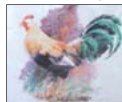
Watercolor By: Chuck Forman