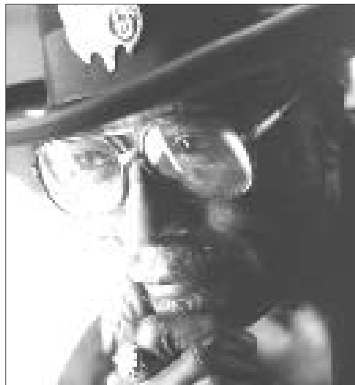
Bo Diddley plays the Leelanau Sands Showroom Sept. 6.

piano jazz; 7-10 p.m., Lavigna, Shanty Creek, Bellaire. (800) 678-4111, Ext. 7880.