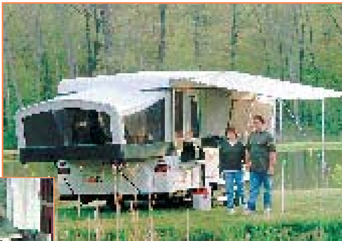
Memory Makers, the Coleman line of pop up campers, sports features like an easy-to-reach waist-level crank location and the Backsaver bed support system. At left is the Memory Makers' Ultra Glide-out Dinette. The side windows are made of clear vinyl.