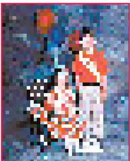
Tyler Gildersleeve Victoria Krajenka East Bay