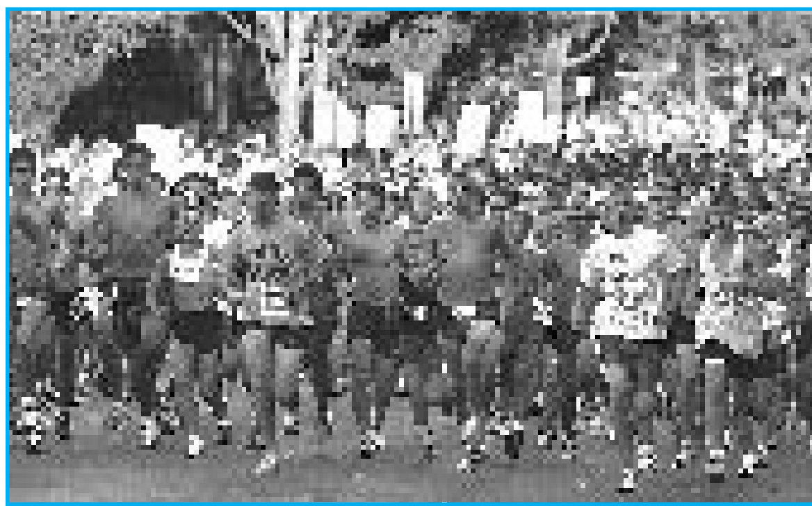
The National Cherry Festival Finale begins bright and early with five different foot races on Saturday, July 13.

In cooperation with WKHQ 106 FM The tradition of the Cherry Pit Spit Contest returns! Join the fun and win daily prizes of award-winning cherry product selections and more. Daily finalists are asked to return on Saturday, July 13 at 5:30 p.m. for the final Pit Spit Off. Festival Open Space at Grandview Parkway and Union Street.