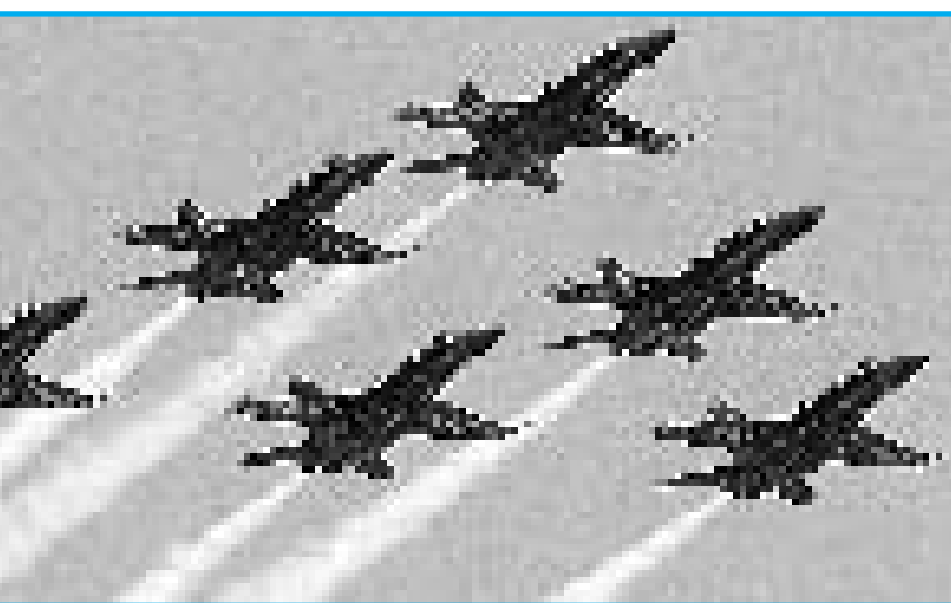
The U.S. Navy's Blue Angels return to the National Cherry Festival.

Visit Traverse City's own favorite amusements near the Festival Open Space. Grandview Parkway at Union Street.