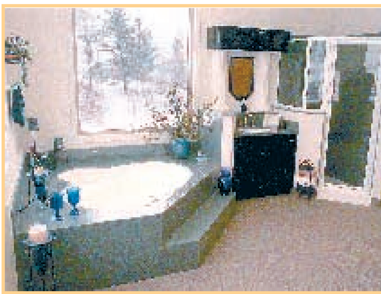
Master baths are becoming more customized, affordable and efficient. Proper space is a main consideration in customized baths. The cultured marble whirlpool bath and accessories are easy to clean and a separate tub and shower frees up the bathroom.

ma-foil cabinets are molded to fit a frame, come in a variety of colors, and hold up to humidity," added Lappan. Another trend is toward marble with a granite look and texture for durability. It's elegant, but doesn't cost as much as granite. For those looking to remodel an existing bathroom, Lappan suggested choosing the dimensions of bath accessories desired prior to remodeling. That way, overcrowding is minimized. For the do-it-yourself types, stores like Home Depot in Traverse City and Petoskey are an option for bath accessories. "Traverse City is very diversified, with many people building a second home or remodeling an existing area," said Richard Och, kitchen and bath designer at Traverse City's Home Depot. Och noted that bath areas are unique to each customer and