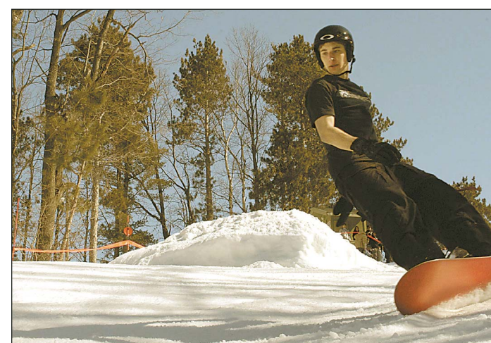
Traverse City High School students and Mount Holiday, with the sponsorship of various community businesses, presented Mountain Mayhem with the snowboard and ski competition Saturday at Mt. Holiday. The first-ever event featured both slope style and big air competitions. Racers competed in two age divisions: 15 and under and a men’s and women’s 16 and older. Traverse City High School students designed and organized the event which drew about 25 riders. Proceeds from Mountain Mayhem will go to the Mount Holiday Terrain Park.