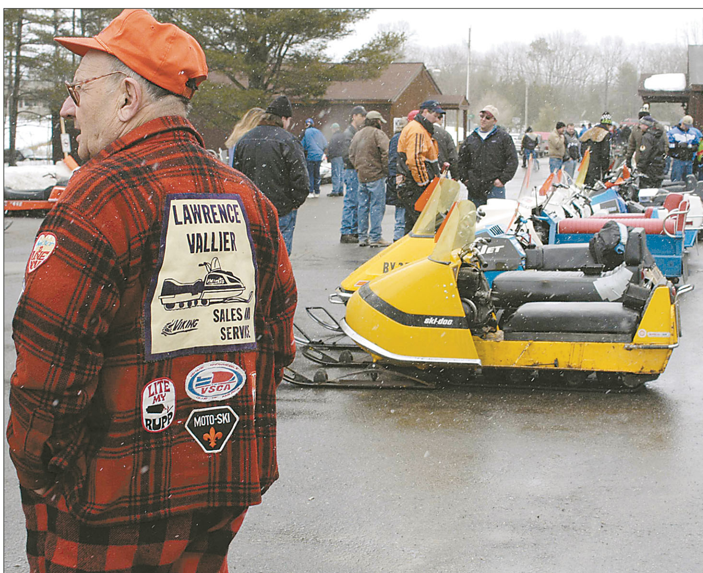
Skee-Horse, Sno-Traveller and Sears snowmobiles were among the large collection of antique and classic sleds on display at Peegeo's Restaurant this past weekend. The snowmobile show featured 99 entries competing in five trophy classes, a swap meet and even an old carburetor toss contest.

Peegeo's snowmobile show features factory racers and one-cylinder classics