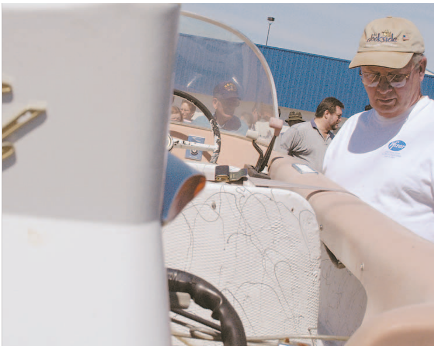
Potential bidders examine a vintage speedboat sporting an equally antique Evinrude motor at the 18th Annual Maritime Heritage Alliance Boat Auction held Saturday in the parking lot at West Marine in Traverse City.

Maritime Heritage Alliance holds 18th annual boat auction