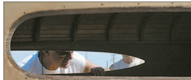
From seaworthy crafts to handyman dryrot specials, the 18th Annual Boat Auction featured a bevy of speedboats, sailboats and rowboats. This in-progress mahogany sailboat from the 1940s fetched a modest $30 winning bid.