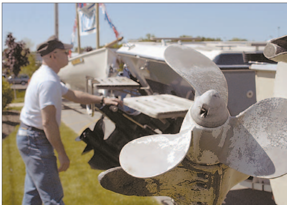
Bidders inspect several inboard and outboard engines attached to boats up for auction. The 18th Annual Maritime Heritage Alliance Boat Auction featured everything from a 30 foot powerboat to an eight foot rowboat. Money raised will benefit programs associated with the 1845 schooner Madeline and the restoration of the replica ship, Welcome.