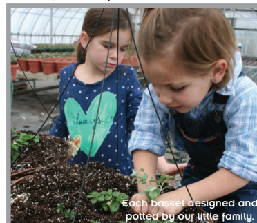
Each basket designed and potted by our little family.