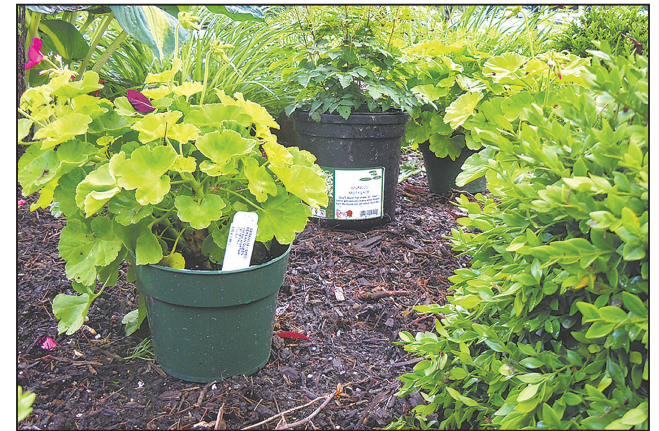
Planting more plants and flowers around the property is one way gardeners can garden in an eco-friendly way.

Mulch, for instance, can be made from recycled rubber and won't impact the environment in a negative way. Just be sure to pur-