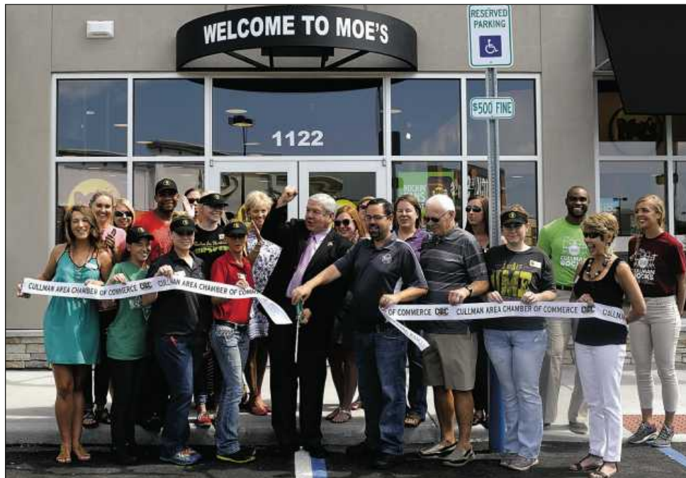
Moe's Southwest Grill