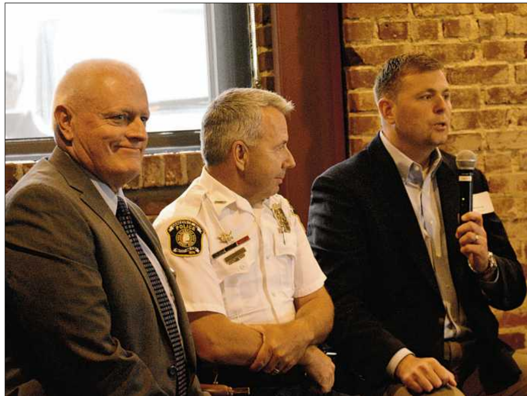
THE CULLMAN TIMES

enforcement is no different. It has also become a subject for both political parties to use during this year's coming election. But when we think of police officers whether we like it or not it triggers an emotional