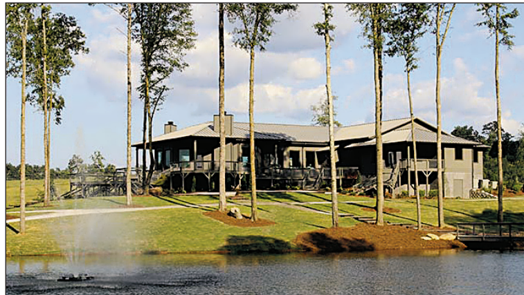
Camp Meadowbrook - Business/Organization "Building a Sense of Community" Awarded to a business that strives to improve the community through additions of a park, play area, park benches or playground, etc.