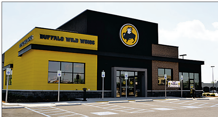
Buffalo Wild Wings - Business/Organization with New Construction Awarded for superlative work for those businesses who have undergone careful construction of a new structure completed within the past three years.

Awarded for substantial improvements to the outside of the property with the most attractive presentation from the street.