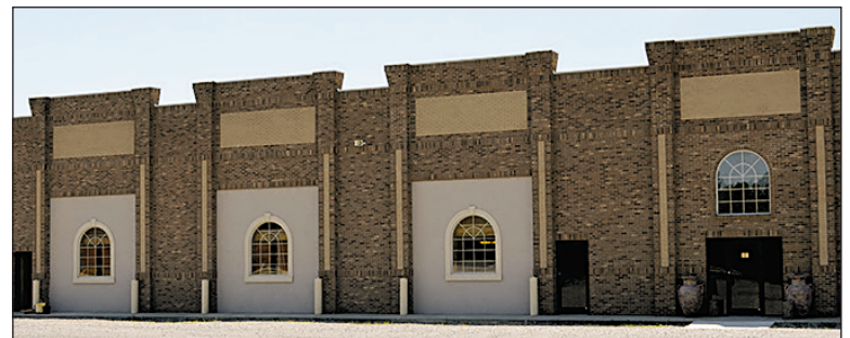
Business/Organization with Best Restoration - Awarded for superlative work in the restoration, rehabilitation, reuse of property or sensitive design.