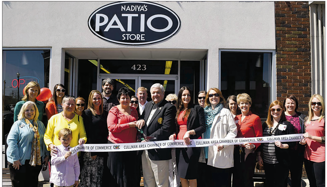
NADIYA'S PATIO STORE 1677 ALABAMA 69, CULLMAN - (256) 708-4413