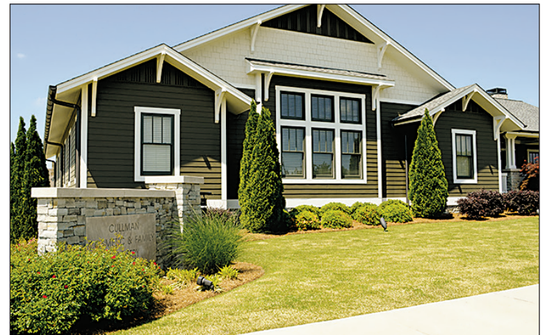
Cullman Cosmetic & Family Dentistry - Business/Organization with Best Landscaping – Small Awarded for best design, maintenance, litter control and plant materials.