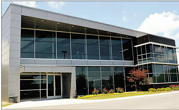
Royal Technologies - Business/Organization with Best Landscaping – Large, Awarded for best design, maintenance, litter control and plant materials

Business/Organization with Best Curb Appeal: Peoples Bank of Alabama – Main Branch