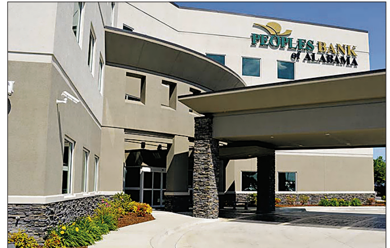
Peoples Bank of Alabama Main Branch - Business/Organization with Best Curb Appeal Awarded for substantial improvements to the outside of the property with the most attractive presentation from the street.

Business/Organization with New Construction: Buffalo Wild